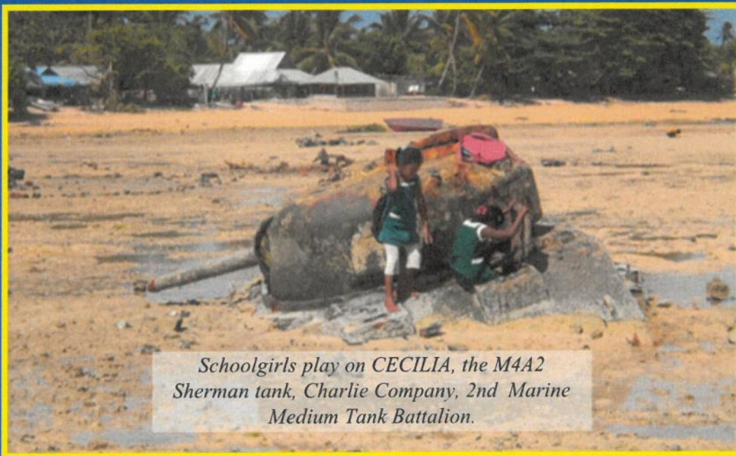
Schoolgirls play on CECILIA, the M4A2 Sherman tank, Charlie Company, 2nd Marine Medium Tank Battalion.

TARAWA 81ST ANNIVERSARY 15 AUGUST TO 19 AUGUST 2024